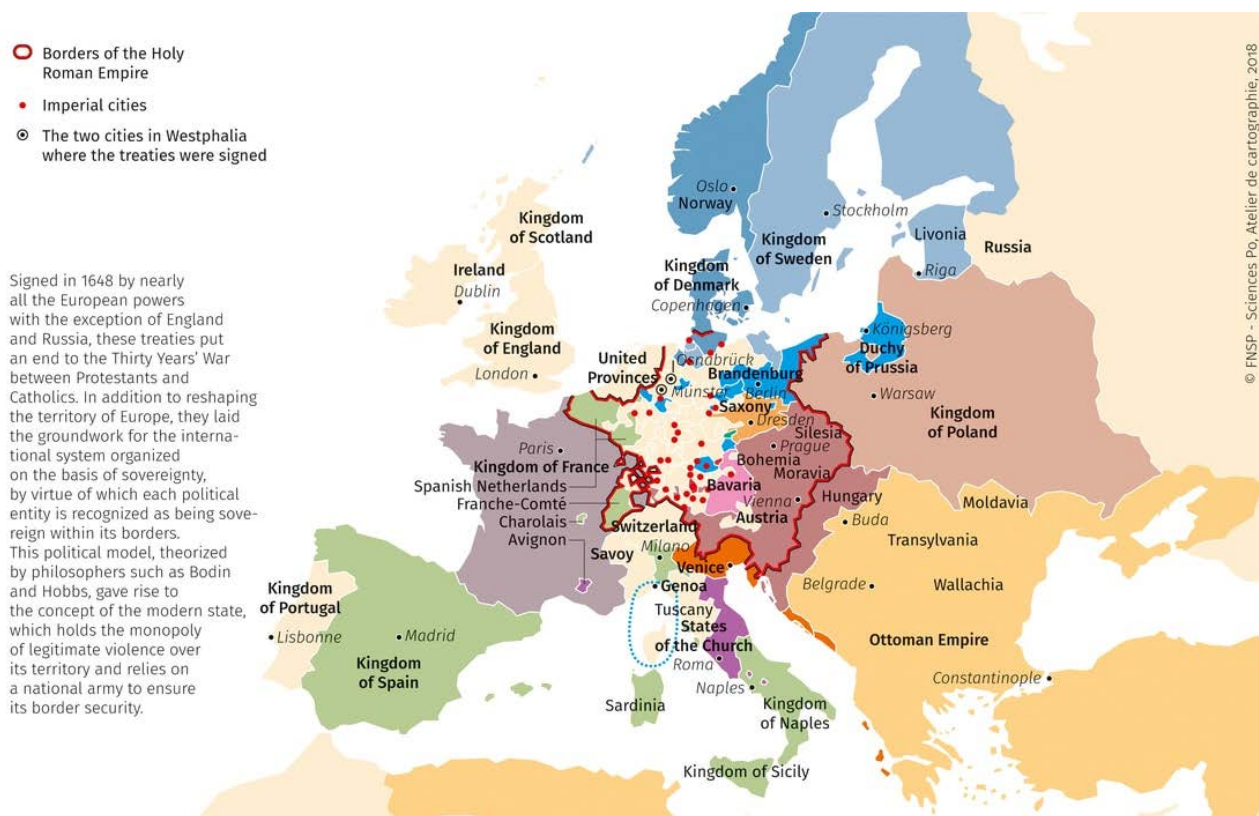
Figure 1. Europe after the Treaties of Westphalia, 1648.

The modern international system consolidated itself upon a juridical and political architecture whose core principle was territorial sovereignty. Authority was thus defined as exclusive within delimited borders, and mutual recognition among political entities became the mechanism through which structural uncertainty in an anarchic environment was mitigated. As an initial outcome, this configuration did not eliminate conflict but rather channeled it within a framework in which the sovereign state functioned simultaneously as both actor and limit.