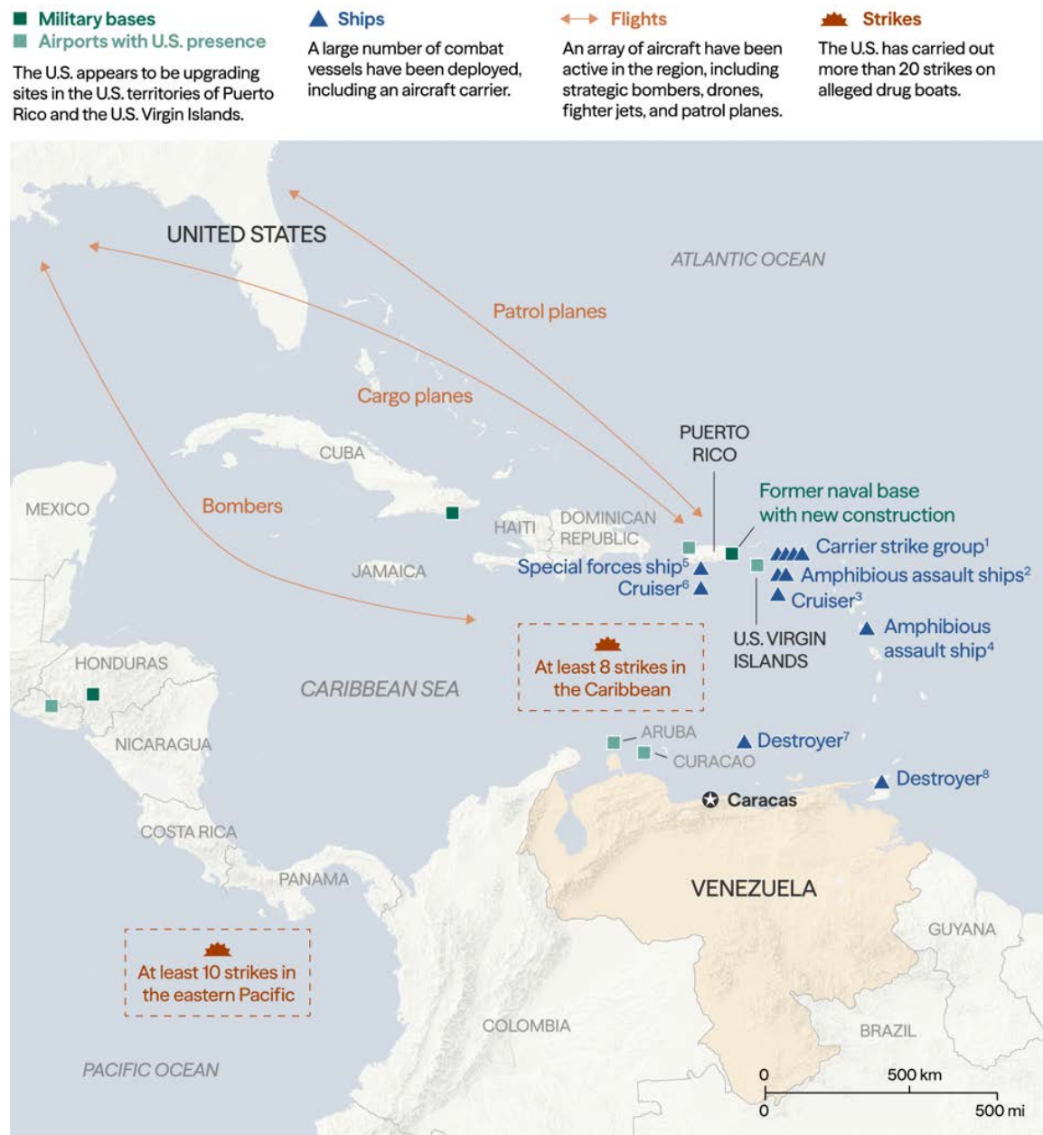
Figure 5. U.S. Military presence in the Caribbean as of December 2025.

U.S. military presence as of December 1, 2025