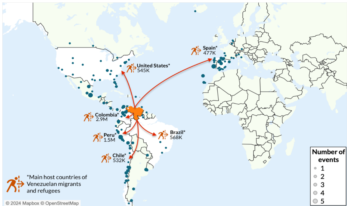
Figure 4. Protests following the 2024 Venezuelan presidential elections in countries with significant Venezuelan populations.

The role of the armed forces has been decisive. Far from operating as a neutral institution, the military establishment has been progressively integrated into the governing structure, assuming administrative and economic responsibilities. This fusion of civil and military power reinforces internal regime stability yet simultaneously shifts the source of legitimacy from popular consent toward coercive capacity in managing an increasingly reactive civil society, both domestically and within the diaspora.