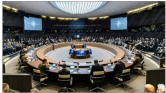
The NATO Military Committee (MC) constitutes the highest military authority of the Alliance and serves as NATO's principal source of military advice, playing a central role in the formulation of military policy, strategy, and operational guidance. https://www.nato.int/en/about-us/organization/nato-structure/nato-military-committee

The crises in Gaza and the Strait of Hormuz, however, introduce a decisive corrective. In Gaza, reports by the United Nations Office for the Coordination of Humanitarian Affairs (OCHA) 11 show that, even amid military logic, humanitarian access, civilian protection, and international legitimacy continue to operate as relevant strategic variables. In Hormuz, the International Energy Agency (IEA) 12 documented that the