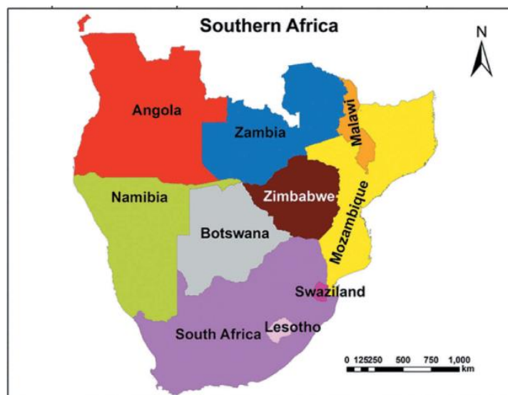
Map of Southern Africa

South Africa's economic and trade links with the rest of the southern African states are traditionally close. The country has extensive access to the sea, more than any other African nation on the continent. Most of the landlocked nations in this African region (Botswana, Zambia, Zimbabwe and Malawi) have historically relied on South Africa for export routes for their goods abroad. Swaziland and Lesotho are almost entirely economically dependent on South Africa and are therefore inescapably dominated by it.