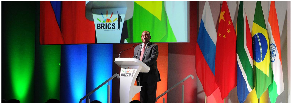
South African President Cyril Ramaphosa at the BRICS summit.

With respect to the BRICS, it does not fall into the category of an aspiring great power mega-state. Its comparative advantage within this relationship is its geostrategic centrality at the confluence of the South Atlantic and Indian Oceans, combined with its status as a traditional southern gateway to the rest of the African continent.