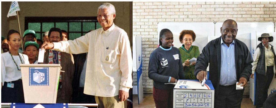
Mandela's vote on 27 April 1994 and Ramaphosa's vote on 29 May 2024.

Nelson Mandela voted for the first time in his life on 27 April 1994 in Inanda, a poor area in the hills above the city of Durban. The choice of location showed that South Africa's future president had not lost his symbolic power after 27 years as the world's most famous political prisoner. After casting his vote, Mandela walked to the nearby grave of John Dube, the first president of his party, the ANC. "I come to tell you, Mr President, that South Africa is now free," he declared 29 .