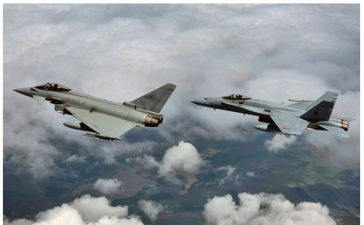
A Spanish F-18 and an Italian Eurofighter patrolling Romanian airspace.