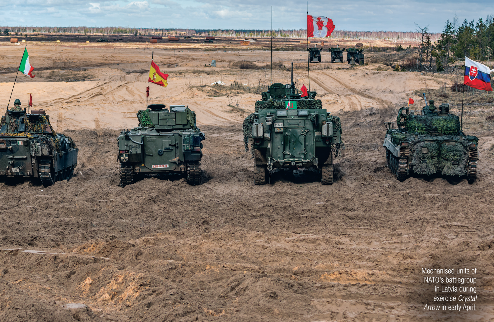
Mechanised units of NATO's battlegroup in Latvia during exercise Crystal Arrow in early April.