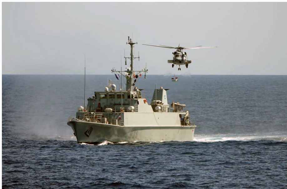
Minehunter Tajo sails in waters of the Mediterranean as part of the Standing NATO Mine Countermeasures Group.

data detected by the radar are received at the Combined Air Operations Centre (CAOC) in Torrejón, which is responsible for directing air and missile defence on NATO's southern flank.