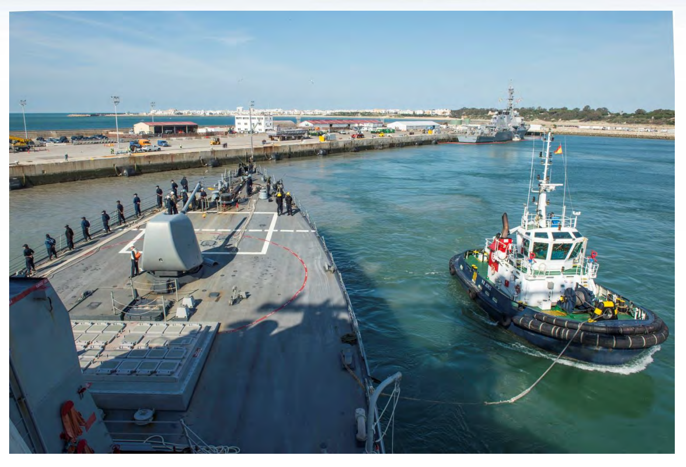
DISTRIBUTION STATEMENT A^6 . Approved for public release